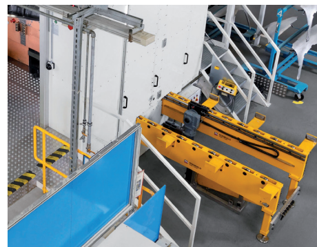
Die changing console with drive and side loading of the press.