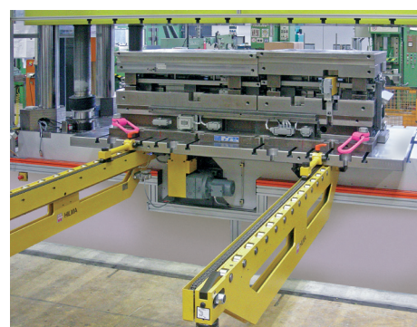
Die changing console with drive